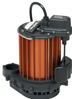
1/3HP Sump Pump Model 237-VMF