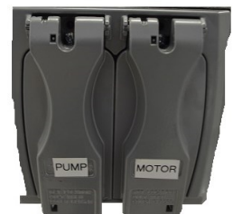
Dual On/Off Switches